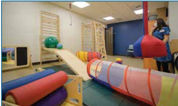
Mason Health's Rehabilitation Services Department features a dedicated pediatric therapy space, with a climbing wall and other elements to help young patients develop.