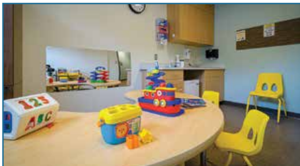
Rehabilitation Services features private spaces for therapists to work closely with patients on fine motor and language skills